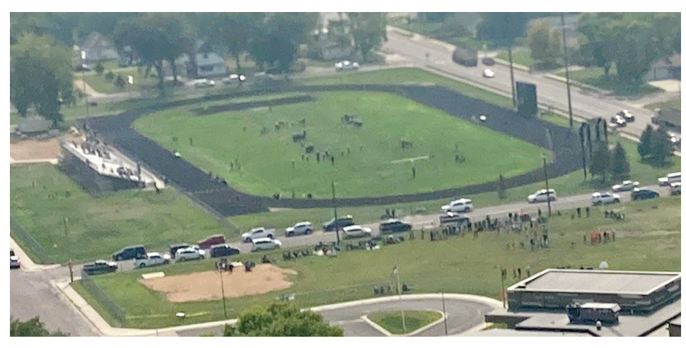
Aerial photo of the successful day

Big thank you to the Groton Firemen and Kens Super Fair Foods for their monetary donations. - Tigh Fliehs