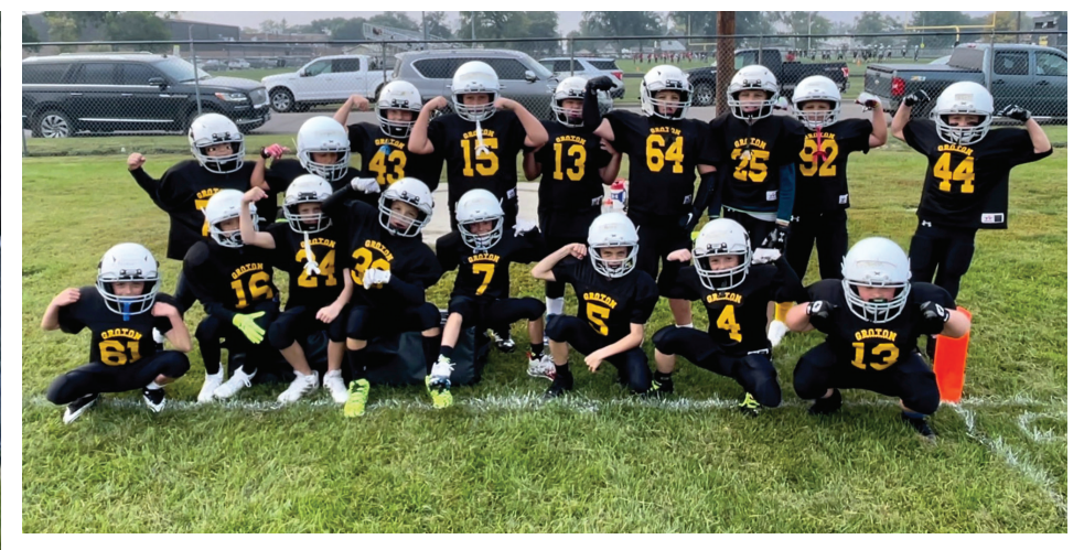
3rd and 4th Grade ready to go for their first game of the day