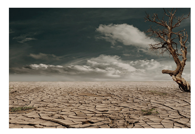
While climate change might benefit the economy overall, we would rather not have to deal with it at all.

The economic costs associated with climate change are so great that even insurance companies, not scientists, are warning people. According to consultants Capgemini and the financial industry body, EFMA, insurance claims from natural disasters have increased by 250 percent over the past 30 years, an in-