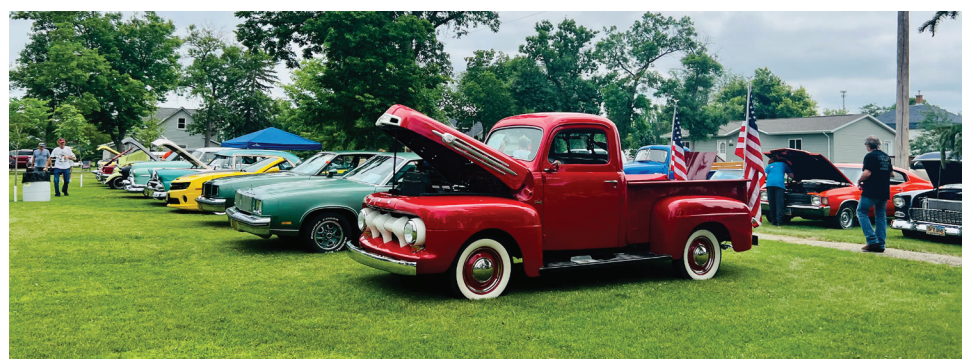
Almost 100 cars were in the City Park on Sunday. Next years event is planned for Sunday, July 9th.