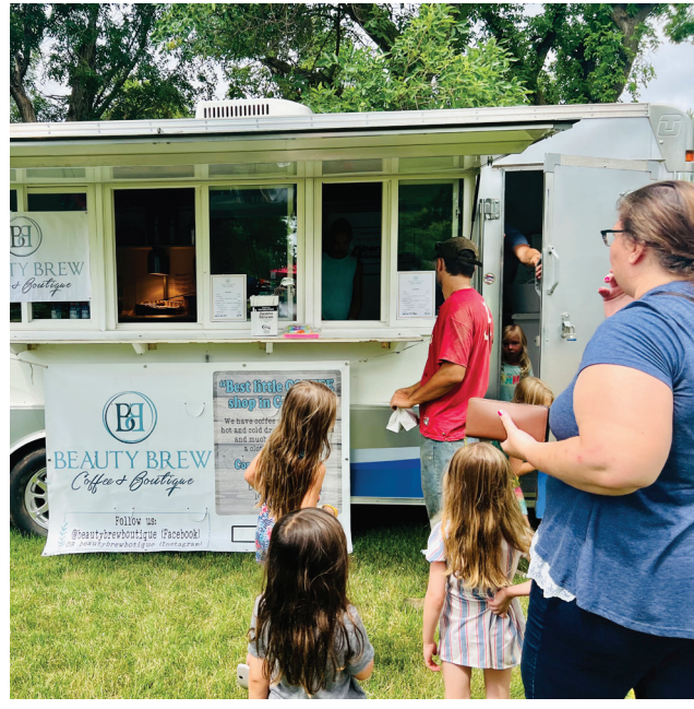
Beauty Brew Coffee & Boutique along with Scotty D's and Burbu Magic Sweets served many people in Groton's City Park.