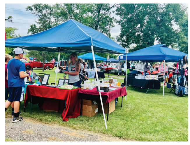
Over 2 dozen vendors were in the City Park including Next Level Nutrition, LipSense, Norwex and many more.