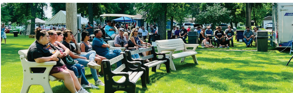
Many people were in the park waiting on car show winners to be announced.

And in a correction, it was stated that Dollar General was unable to sell alcohol due to its non-payment and filing of the liquor license since June 1. The actual date was July 1. Since then, they have filed the paperwork and are able to resume selling alcohol.