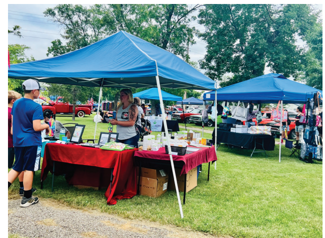
Over 2 dozen vendors were in the City Park including Next Level Nutrition, LipSense, Norwex and many more.