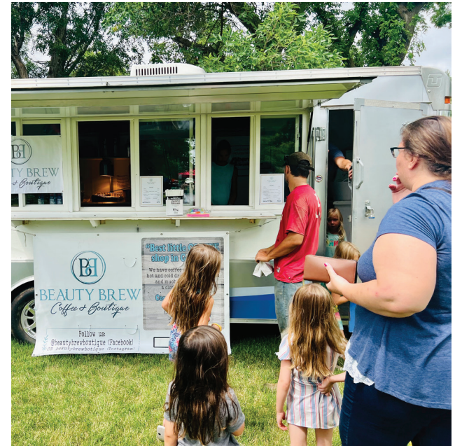
Beauty Brew Coffee & Boutique along with Scotty D's and Burbu Magic Sweets served many people in Groton's City Park.