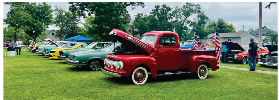
Almost 100 cars were in the City Park on Sunday. Next years event is planned for Sunday, July 9th.