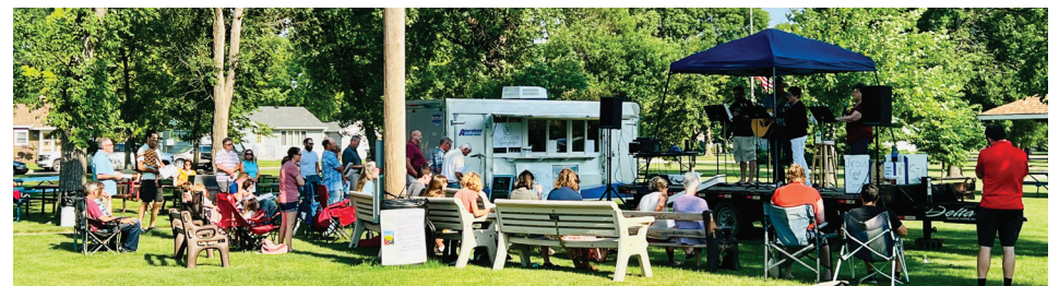
CM&A Church led the service at the City Park before the car show.