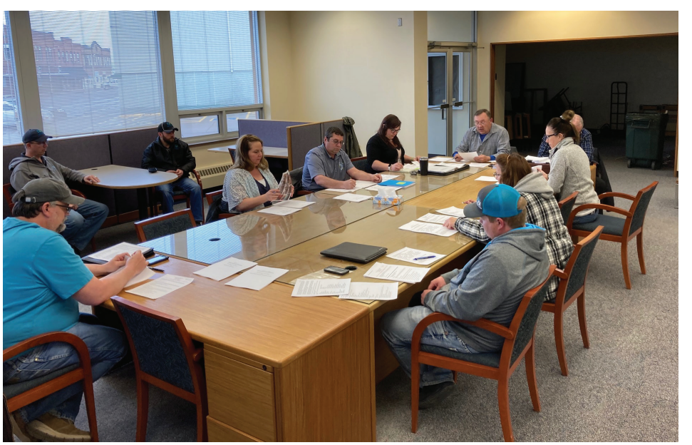
The new council table (which also serve as a library table) at the new city hall location at the former Wells Fargo building.

EarthTalk® is produced by Roddy Scheer & Doug Moss for the 501(c)3 nonprofit EarthTalk. See more at https://emagazine.com. To donate, visit https//earthtalk.org. Send questions to: question@