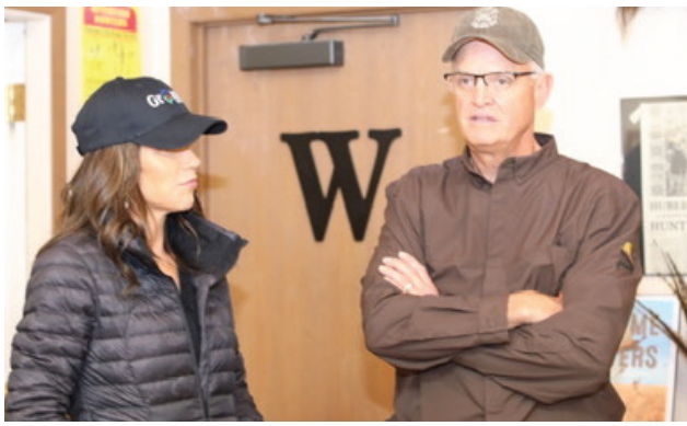
Governor Kristi Noem and Bruce Babcock discuss the lodge business during a tour of Base Kamp Lodge, Groton SD.