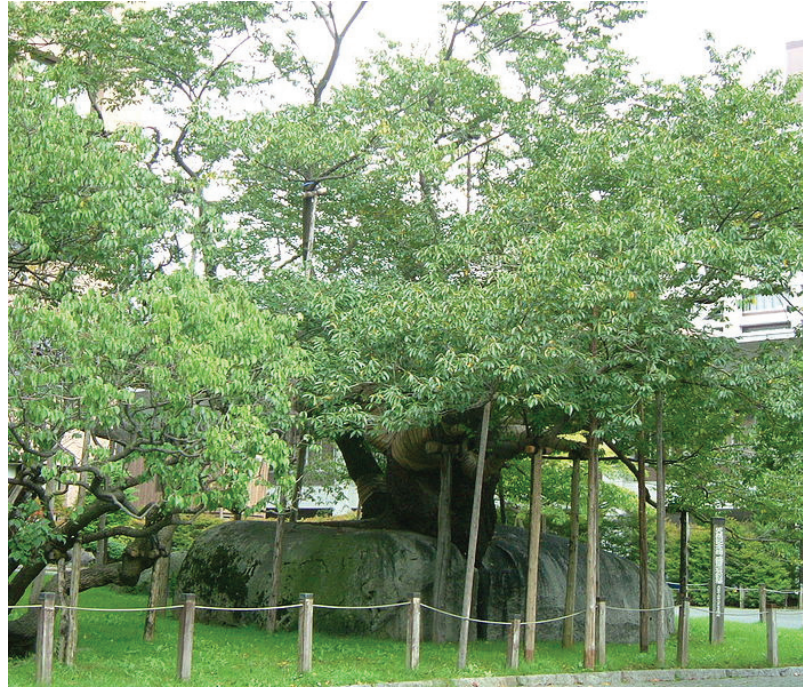
Rock-breaking Cherry Tree. The tree grew between a crack of rock. Approximately 400 years old. Uchimaru, Morioka, Iwate prefecture, Japan.