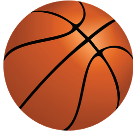
Groton Area 39 Tiospa Zina 36

Get B&W 8.5x11 copies for just 9 cents at the Groton Independent, 21 N Main, Groton.