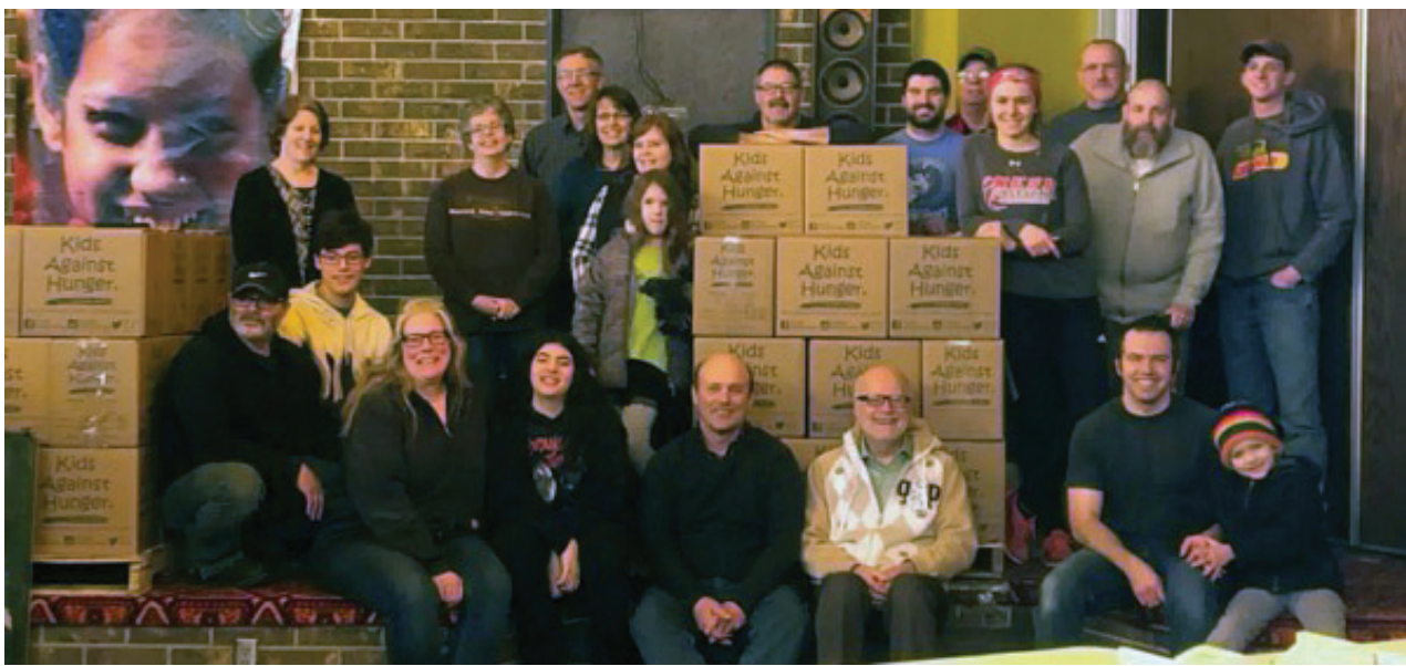
Members of the Groton C&MA Church helped pack boxes for Kids Against Hunger in Aberdeen on Sunday. They packed 8,640 meals.