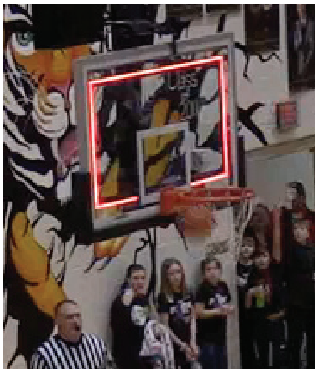
There is the game winning shot as the ball swishes through the hoop at the buzzer.