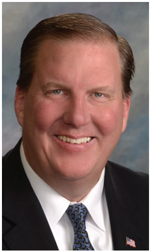
Sen. Jeff Partridge, R-Rapid City.

give additional revenue back," Partridge said then.