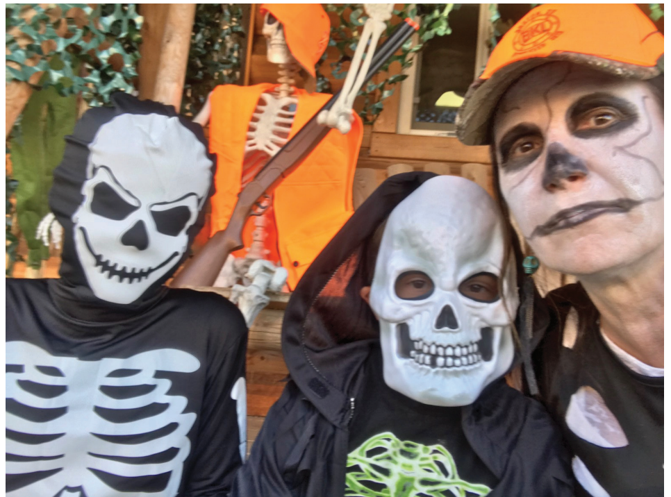
The Base Kamp Lodge was one of many downtown businesses taking part in Trick or Treaters