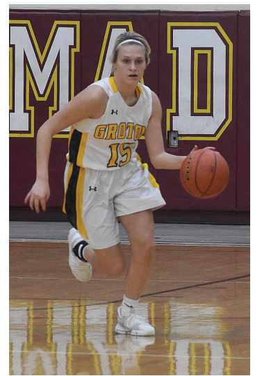
brings the ball up court for the Tigers.