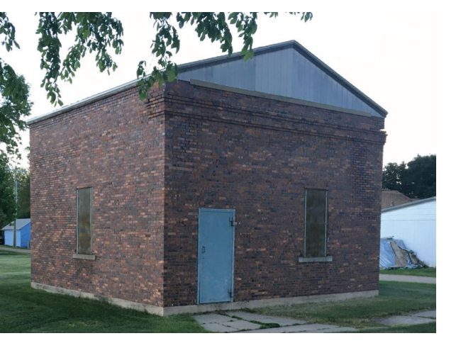
The old jail house on First Ave. East, east of Third Street.

Left: This is the view of the inside of the jail building.