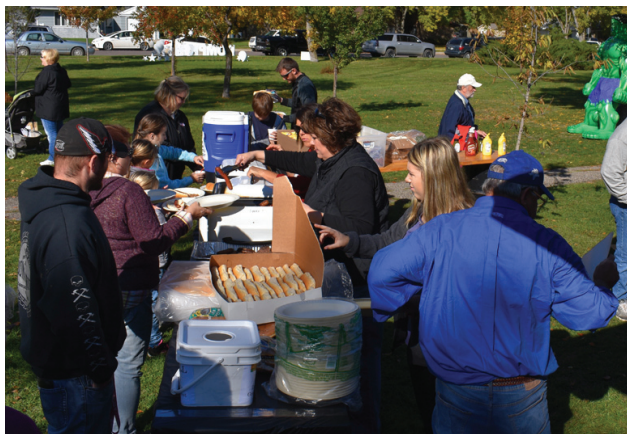
There were servers and cooks to help feed around 900 people who attended the Pumpkin Fest on Saturday.