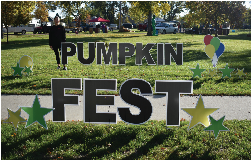
Suzette Gengerke of Gypsy Signs donated the signs for the Pumpkin Fest.