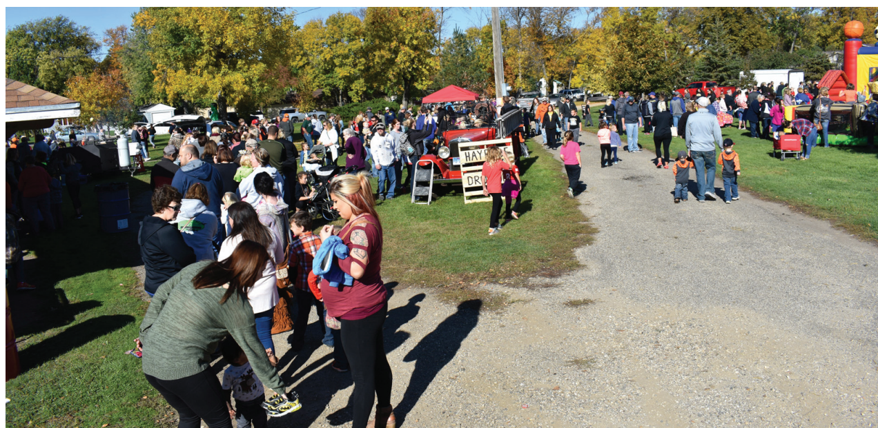
A very large crowd turned out for the Second Pumpkin Fest held Saturday at the Groton City Park. It was such a huge success that even the high wind advisory was cancelled. It turned out to be a perfect day with temperatures in the 70s and a light southwest wind. It was hard to estimate how many people showed up, but it looked like the attendance was triple of what it was last year, perhaps around 1,500 people.