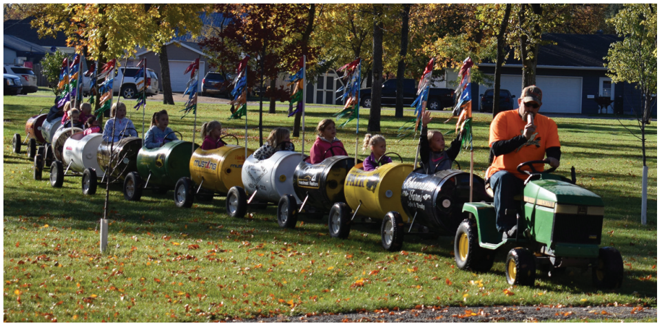
The little train got a lot of riders throughout the day on Saturday.