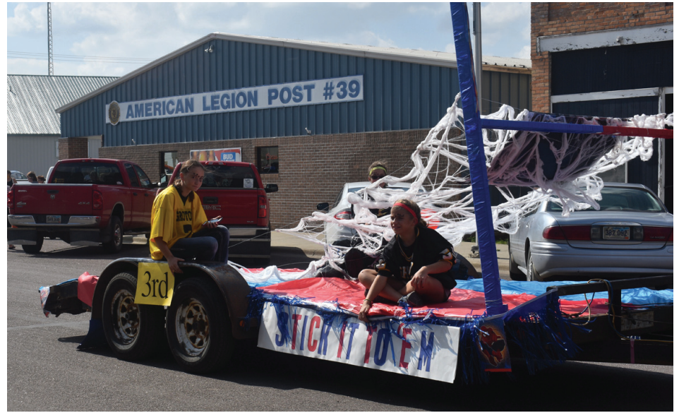
The seventh grade float took third place.