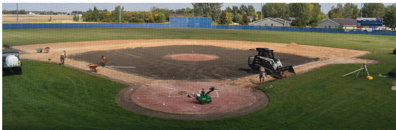
Locke-Karst Field is getting a new infield this year. Weber Landscaping has removed the sod and will be putting a new sod down next week.