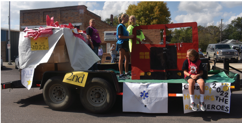
The eighth grade float took second place.