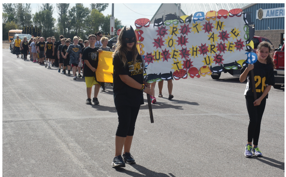
The fifth graders march for the last time through a homecoming parade.