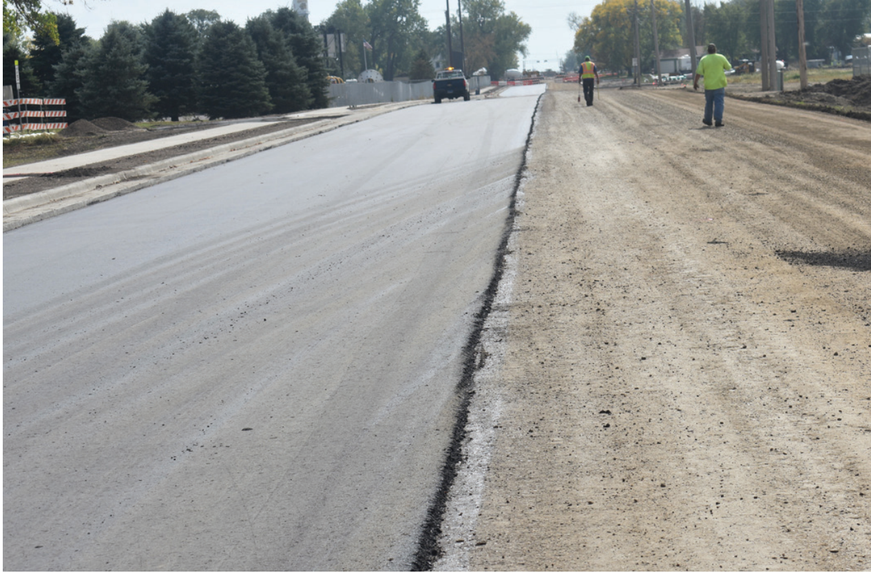
The long waited process of putting down asphalt on SD37 through Groton has begun. The first 1.5 inches of asphalt was laid down on Friday from US12 to Fifth Avenue.