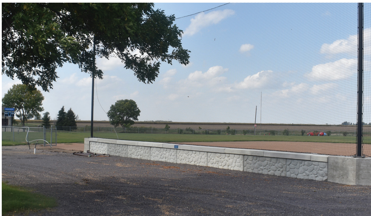
The dugouts on the smaller fields at the Groton Baseball Complex have been removed with new ones to be installed for the next season.