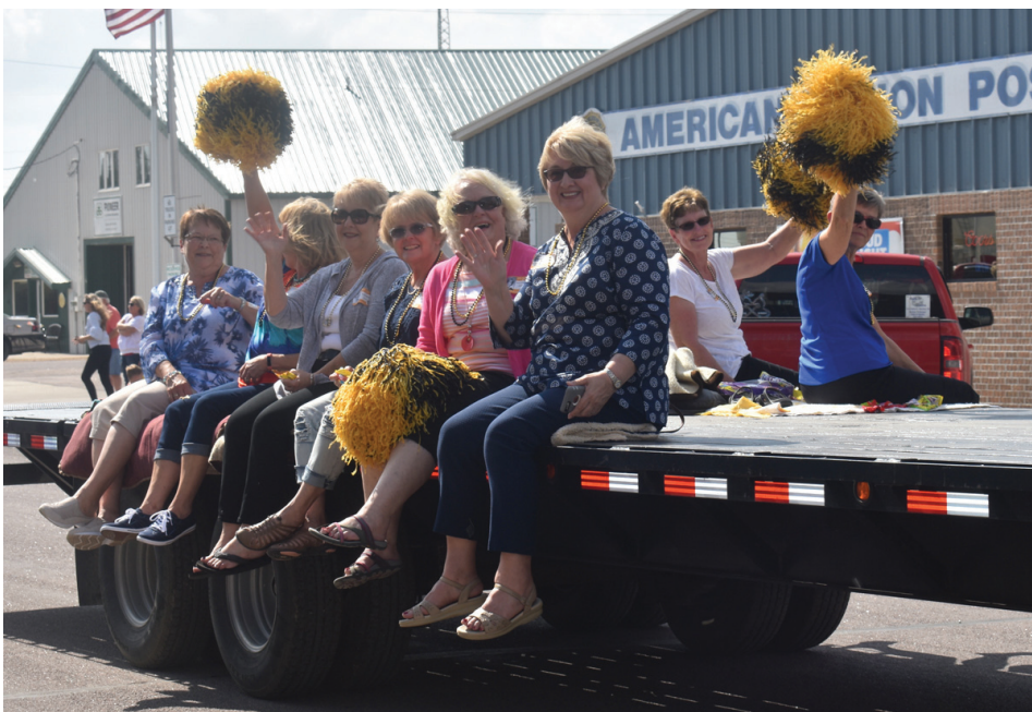
The Class of 1967 is cheering on the Tigers!