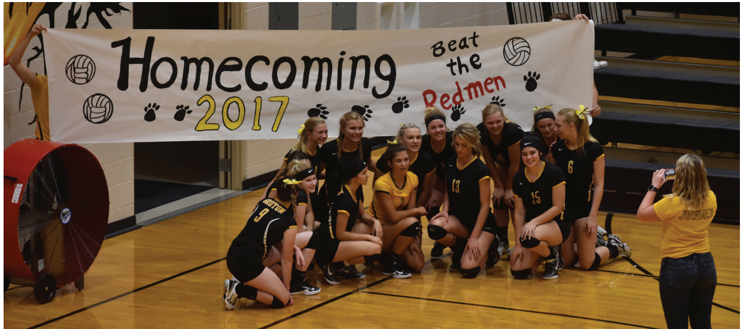
The varsity volleyball team posed for a picture in front of the banner that they would bust through.