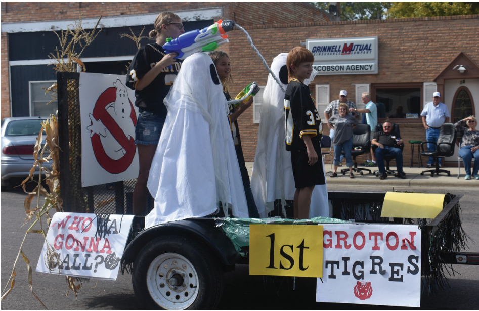
The sixth grade float took first place.