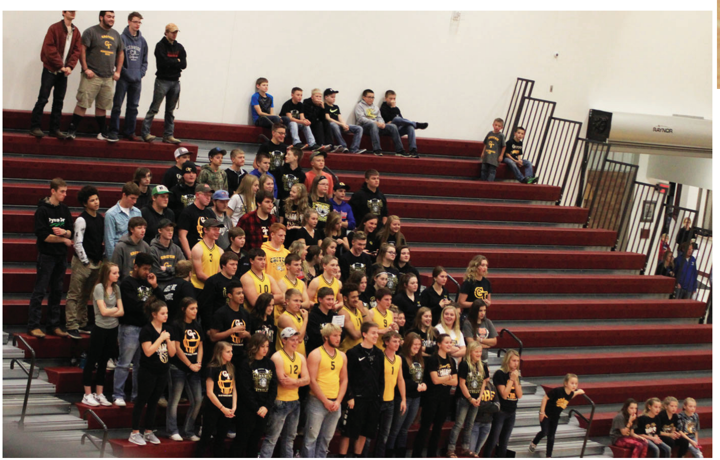
The Groton Area football team stopped in Madison to cheer on the Lady Tigers in the Volleyball Sweet 16.