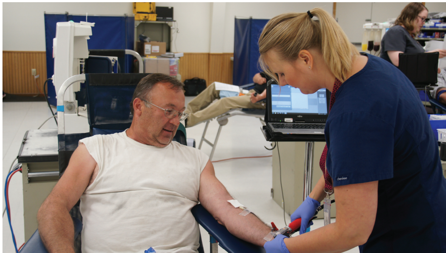
Mayor Scott Hanlon is shown getting prepped for his donation at the recent Groton Blood Drive.