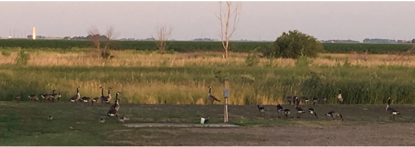
There is a gaggle of geese at the HRH Mobile Home Park. It looks like there are four families of geese being raised at the park.