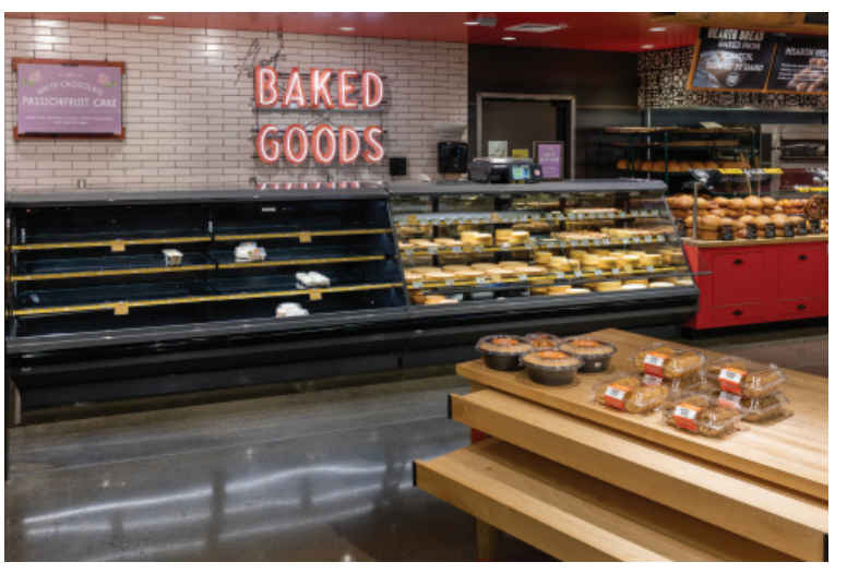
Whole Foods Market gives shoppers a startling preview of what dessert would look like without pollinators.

97 percent of the dessert choices featured in the bakery department would either disappear or would be significantly altered; only 32 of 1,057