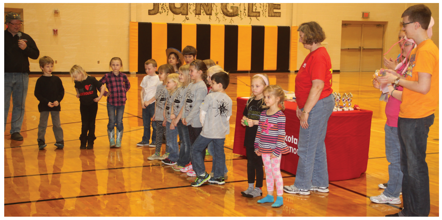
The Rising Stars were recognized at the awards event held Saturday at the Northeast Region DI Tournament held in Groton.

Monday, March 7, 2016 • Vol. 22 - No. 221 • 7 of 31