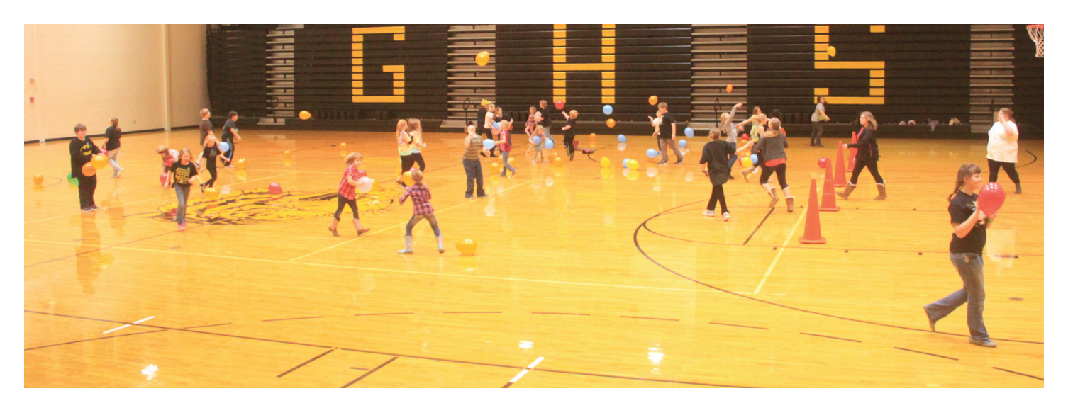
Prior to the awards ceremony, the youth enjoyed playing with balloons and bubble wrap.