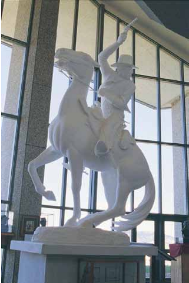
The photograph is the statue of Vaughn at the High Plains Western Heritage Center.

A map of cattle trails and a life-size statue of James A. "Tennessee" Vaughn astride a horse dominate the Founders Room at the High Plains Western Heritage Center in Spearfish.