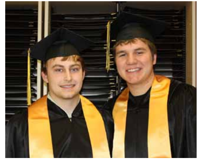
Ruden Family Ag Related Career Scholar-ships