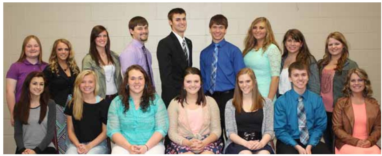
Regents' Scholar Diploma

Fifteen seniors from Groton Area High School are recipients of a Regents' Scholar Di-ploma awarded by the South Dakota Department of Education and Cultural Affairs and the South Dakota Board of Regents.