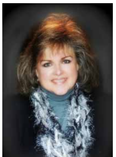
by Beverly Patterson

If you ever want to be incredibly entertained and happy beyond belief some would say it's up to you and that you and only you are responsible for your own happiness. I can't say I disagree 100% but surrounding yourself with awesome people also helps.