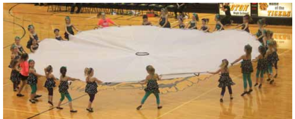
The Sugar Babes performed at half time of the varsity Groton Area and Clark-Willow Lake basketball game Friday night.