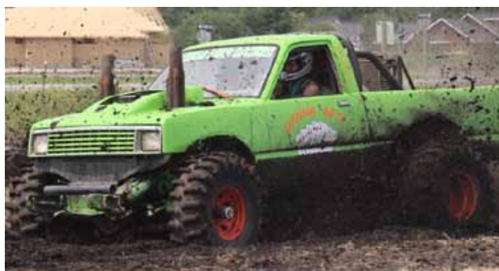
Wanna Bet? driven by Travis Larson of Larson Racing, kicks up mud at the starting line.