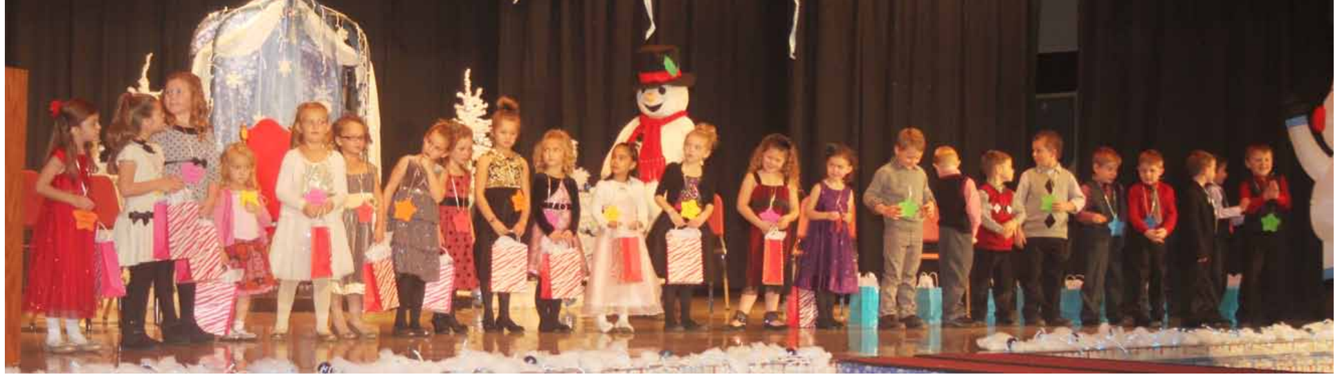
These princesses and prince candidates were introduced and then interviewed. The most popular activity among the princesses was painting and the most popular among the prince candidates was recess.