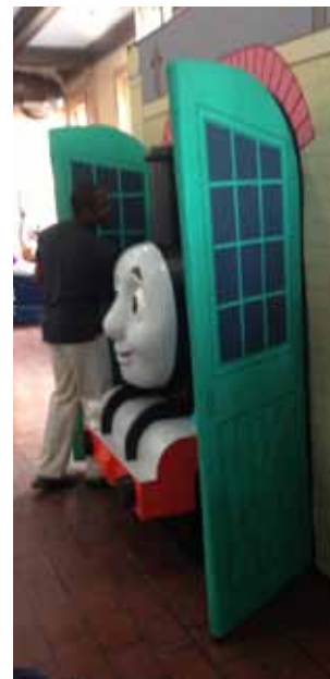
Thomas the Train had its picture taken with a lot of children.