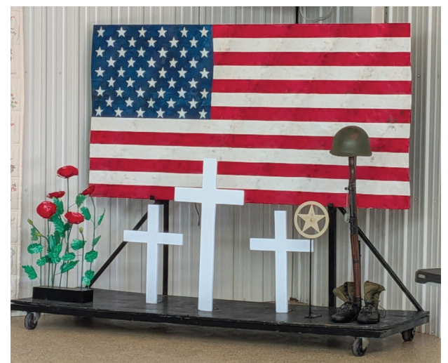
The photos above and to the left were submitted by Cara Dennert, showing more of a closeup of the display.