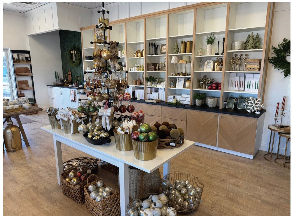
The Cloverly store is currently specializing in Christmas items. Soon, Valentine's will fill the store.