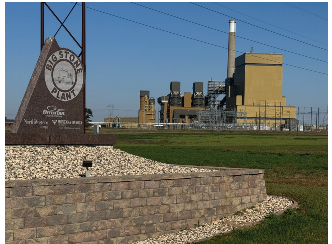
The coal-fired electricity plant in Big Stone City, S.D., is shown on Sept. 25, 2025.

Beyond that, the new transmission lines will protect utility customers by allowing for energy to flow during natural disasters and should ultimately save ratepayers money, Prorok said.