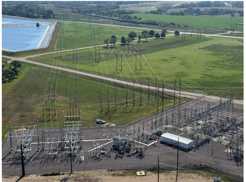
These 230-kilovolt power lines carry electricity generated by the Otter Tail Power Company plant in Big Stone City, SD., shown on Sept. 25, 2025. Big Stone City could see development of a 765-kilovolt power line in the coming years.

However, applications for new wind production facilities have slowed dramatically, largely due to a lack