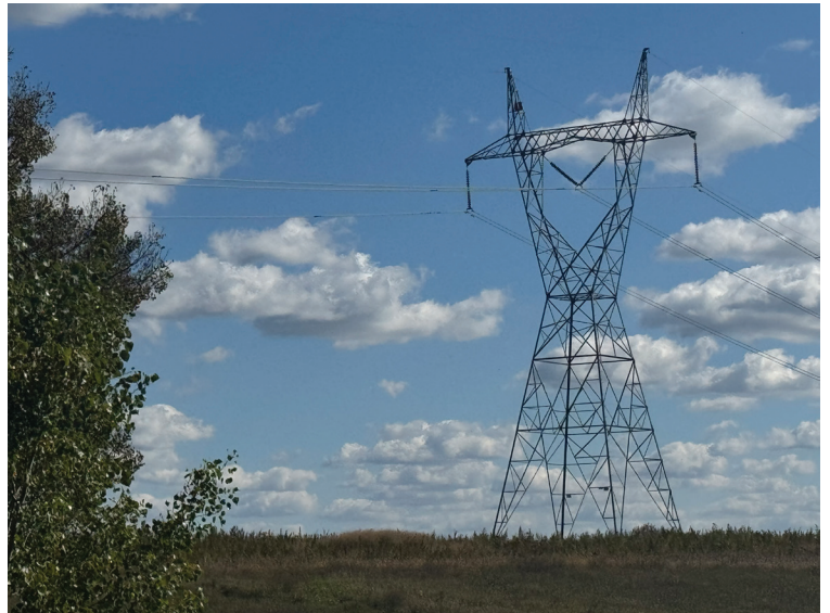
This high-voltage electricity tower is shown on Sept. 24, 2025 in a farm field near White, S.D.