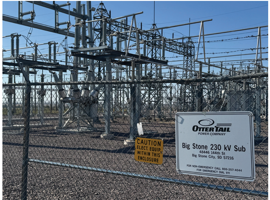
This energy substation is part of the transmission system at the Otter Tail Power Co. plant in Big Stone City, S.D., shown on Sept. 25, 2025.

The MISO expansion plan also has been the subject of complaints filed with federal energy regulators arguing that the transmission line plans should be halted because the grid operator overstated the finan-