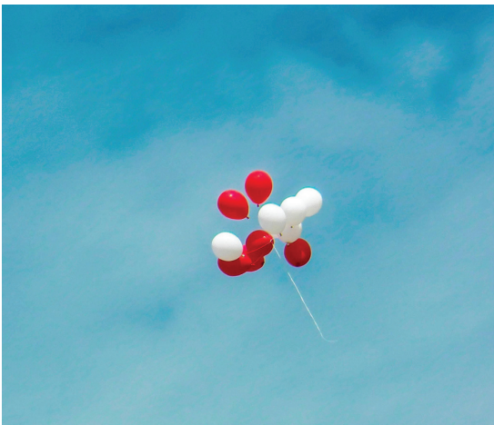
Escaped balloons are increasingly becoming a nuisance and a contributor to the degradation of our natural environment...

Escaped balloons have become a prevalent source of land and marine pollution worldwide, so much so that balloons were ranked as the third deadliest form of marine debris behind fishing gear and plastic bags. Marine debris, defined as human-created waste in large bodies of water, has significant negative impacts on wildlife, human health and safety, global economies and habitats. One way balloons can impact wildlife is by entangling animals, leading to serious injury or death in extreme cases. Animals may also attempt to consume balloons, causing throat or digestive tract obstruction and gut damage. Christian Daniels, creator of the Desert Balloon Project, explained, "Desert tortoises mistake them for flowers and will eat them. The desert tortoises are already in danger with the constant building and loss of habitat and predation, and the mylar balloons cause another disturbance with them." Besides desert tortoises, birds and bighorn sheep are also often impacted. Beyond impacts on marine life, balloons are a big contributor to marine and land pollution, as they're able to travel vast distances—over a thousand miles in certain cases. Foil Mylar balloons cannot break down and instead simply divide into smaller pieces of plastic. While the standard latex balloon is biodegradable, the breakdown process takes