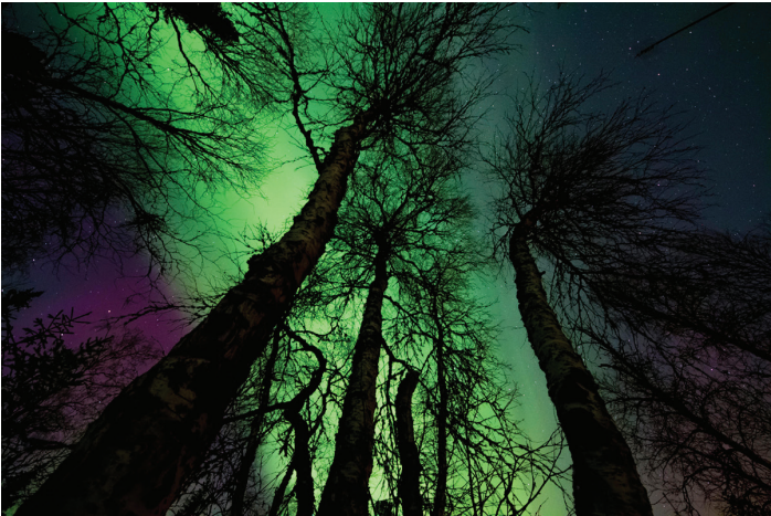
People across the Northern Hemisphere as far south as the southern U.S. have been able to see the northern lights in recent years due to increase solar storms.

To combat the implications of intense northern lights, government agencies can improve protections in power grids and warning systems that caution against solar storms. Infrastructure companies can also build radiation-resistant satellites that remain in orbit and avoid polar routes during high solar activity.