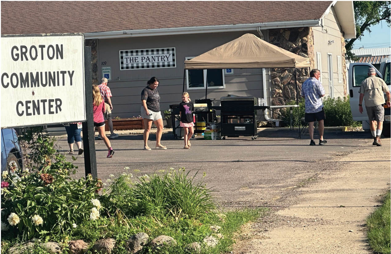
People were coming and going during the Groton Community Transit Fundraiser held Thursday at the Groton Community Center.

Vol. 142 No. 40 ♦ Groton, SD ♦ Wednesday, June 25, 2025 ♦ Established in 1889