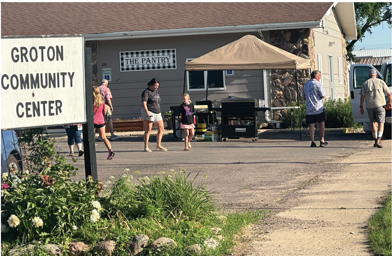
People were coming and going during the Groton Community Transit Fundraiser held Thursday at the Groton Community Center.

Vol. 142 No. 40 ♦ Groton, SD ♦ Wednesday, June 25, 2025 ♦ Established in 1889