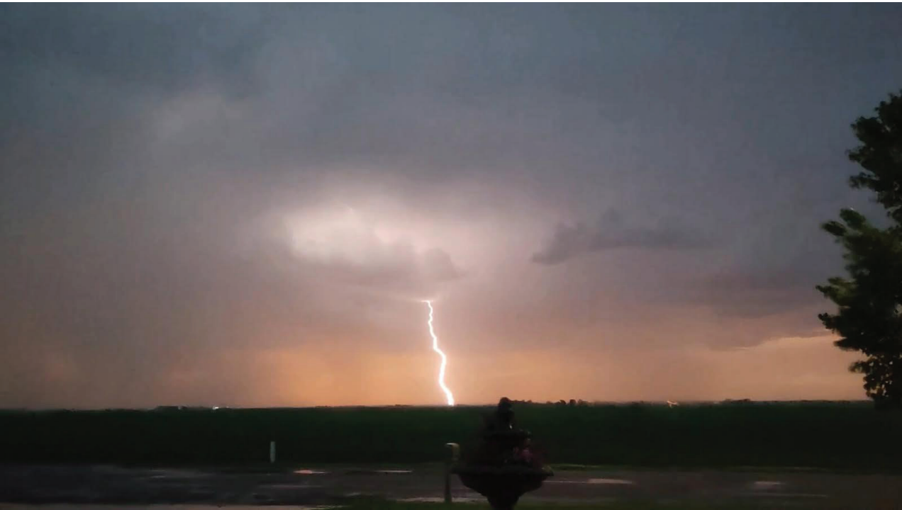
Sharp lightning and loud thunder rolled through the Groton Area early Monday morning.