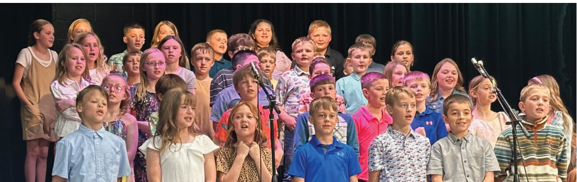
3rd Grade: "I Love the Mountains" and "Lean on Me"