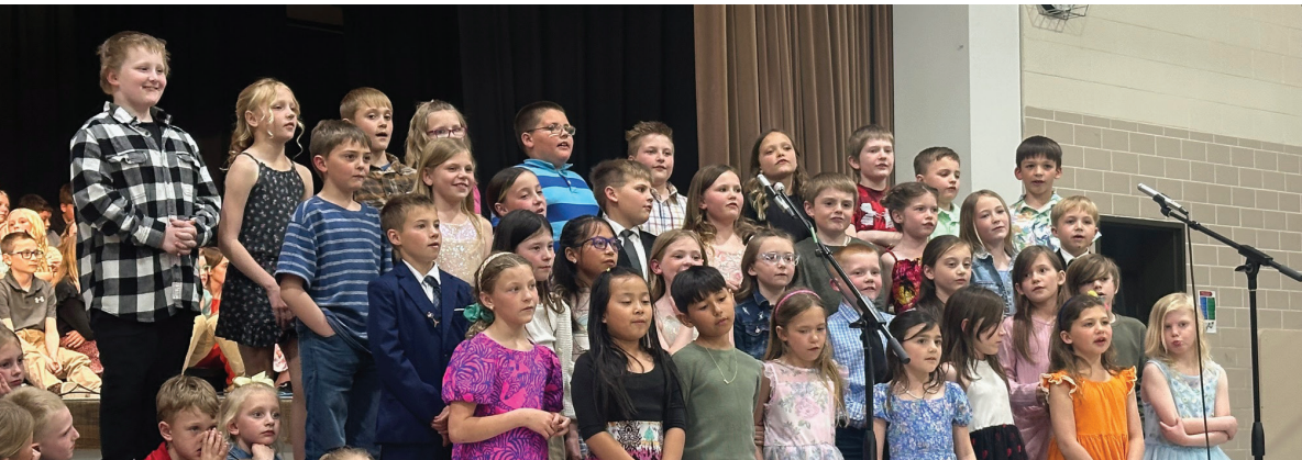
2nd Grade: "John Jacob Jingleheimer Schmidt" and "Count on Me"