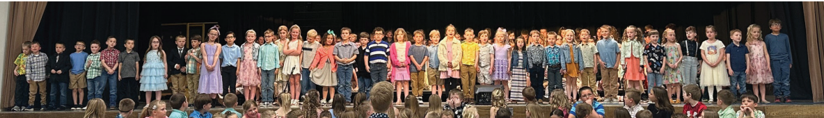
JK/Kindergarten: "Old Macdonald" and "Down on Grandpa's Farm"