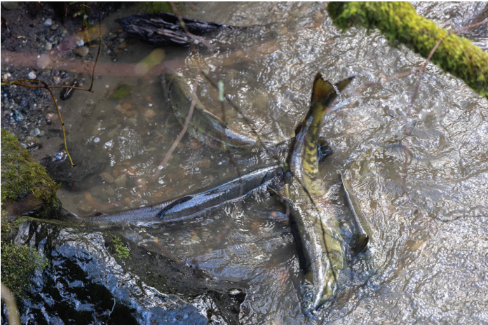
2025 was a record year for chum salmon returning to Piper Creek in Seattle.