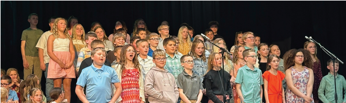
5th Grade : "Die With A Smile " and "Seasons of Love"