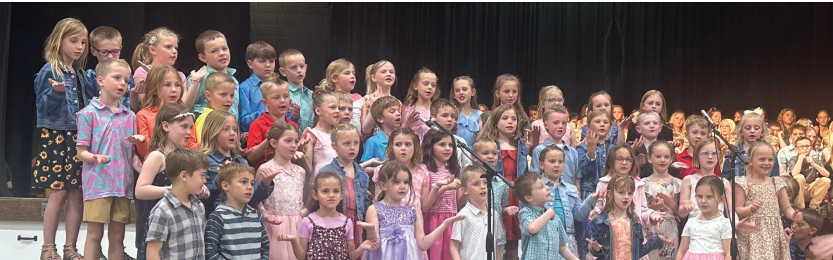
1st Grade: "Oats and Beans and Barley Grow" and "Do-Re-Mi"