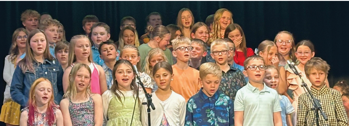
4th Grade: "Crawdada Song" and "Take Me Home Country Roads"