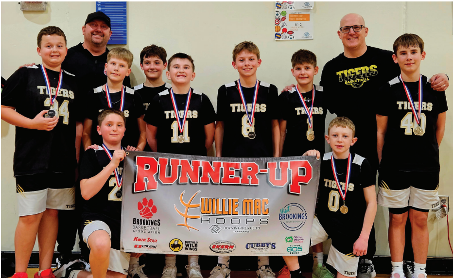
Groton 6th grade boys finished their season as the runner-up in the Willie Mac tournament in Brookings.