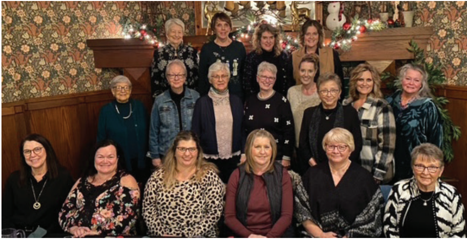
Members of the Groton PEO Chapter AC Christmas Celebration December 9, 2024

Vol. 142 No. 12 ♦ Groton, SD ♦ Wednesday, Dec. 11, 2024 ♦ Established in 1889