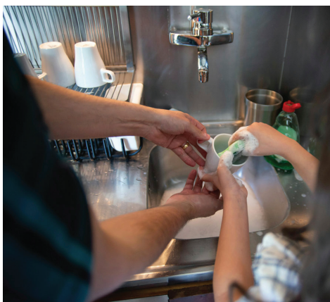
Many well-known dish soaps contain synthetic chemicals and additives that are harmful.

Luckily, there are several options that are better for the environment and individual health. Cleancult Liquid Dish Soap is made from plant bases and does not use animal testing. It cleans efficiently, is easy on sensitive skin, does not contain harmful chemical, and received an "A" environmental rating. Dr. Bronner's Pure Castile Liquid Soap, generally known as a camping dish soap, is another grade "A" certified soap with strong Environmental, social, and governance (ESG) principles guiding production. It uses basic ingredients, designed to be safe in waterways. Koala EcoNatural Dish Soap is made without synthetic fragrances, using essential oils instead, and holds two toxic chemical-free certifications. These alternatives are available at a slightly higher price point, but are much worth the investment.